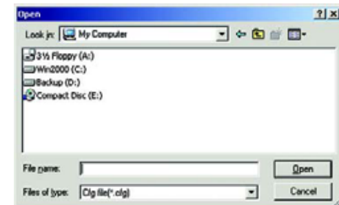
Figure 6-6: Importing a Profile